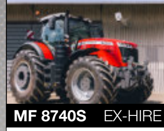
400hp. Low hours,