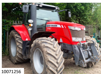
10071256 MF 7718 2016, DYNA 6, FRONT LINK £42,500