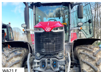
WA21 E MF 8S.265 DYNA EP, FRONT LINK AND PTO - £129,850