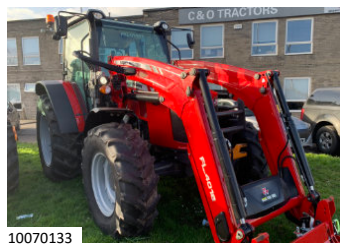
10070133 MF 5710 LOADER, PASSENGER SEAT, POWER SHUTTLE, £41,000