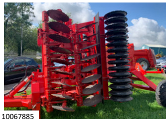
10067885 HE-VA 450 DISC ROLLER £25,500