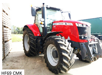
HF69 CMK MF 7722S EX-HIRE DYNA 6, 50K, 1976 HRS £72,500