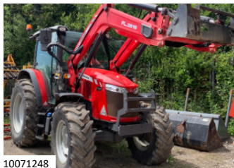
10071248 MF 5711M 2,000 HRS, '68, 4WD, LOADER - £43,500