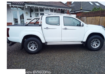
New BY9800Pro ISUZU D-MAX ARCTIC 2017, UNDER 30K MILEAGE GREAT COND. - £33,699