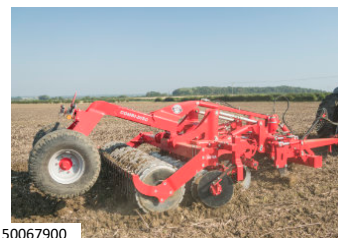
50067900 HE-VA 3M COMBI-DISC EX-DEMO TRAILED RIGID £27,000