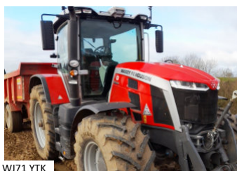
WJ71 YTK MF 8S.265 DYNA EP, FRONT LINK AND PTO - £129,850