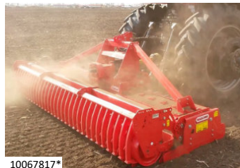
10067817* MASCHIO RAPIDO PLUS 4M POWER HARROW £13,000