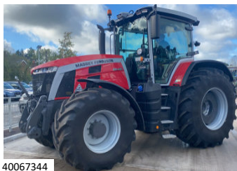
40067344 MF 8S.265 DYNA 7, 850HR, WARRANTY, GUIDANCE - £118,000