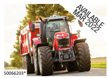
MF 7722S EX-HIRE DVT, EXCL. SPEC TRIMBLE CM, £94,000