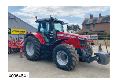
MF 7719 S 50 KPH, DVT, AUTOGUIDE READY – £79,950