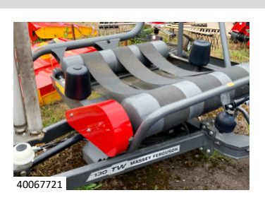
MF TW 130 TRAILED BALE WRAPPER £9,750