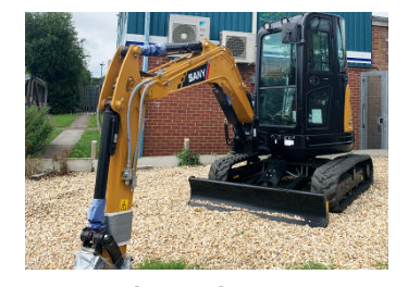
SANY SY35U SHORT TAIL SWING 5 YEAR WARRANTY, £26,000