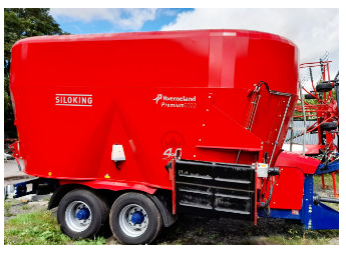
KVERNELAND SILOKING 30 CUBE, EX-DEMO DIET FEEDER, £39,950