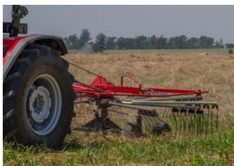
MF 421 RAKE SINGLE-ROTOR RAKE, THREE-POINT