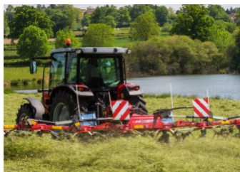
MF TD 868 DN MOUNTED TEDDER TRANSPORT CHASSIS, 8.60M