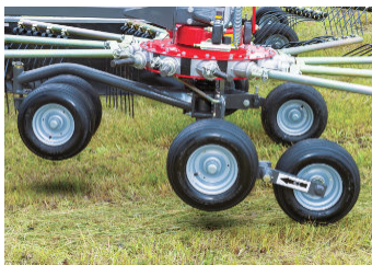
MF 762 TRC TWIN ROTOR SIDE DISCHARGE RAKE