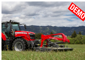
MF DM 316 FQ KC DISC MOWER WITH 3D GROUND ADAPTION