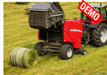
RB4160V XTRA ROUND BALER, 13 KNIVES, BRAKES