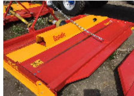
TEAGLE TOPPERS, 5, 9, 510 IN STOCK NOW