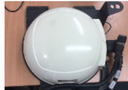
TOPCON RECEIVER - ENABLED TO EGNOS SUBS. - £1,100