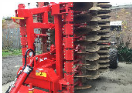
HE-VA DISC ROLLER - EX-DEMO £23,250