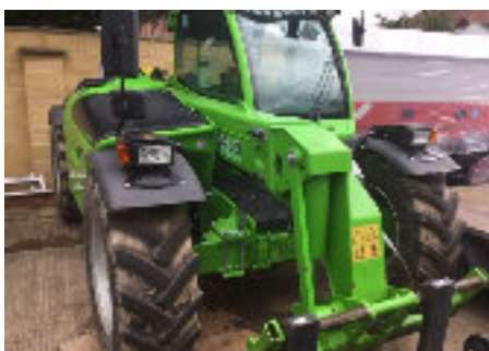
MERLO 35.7 - EX-DEMO POA