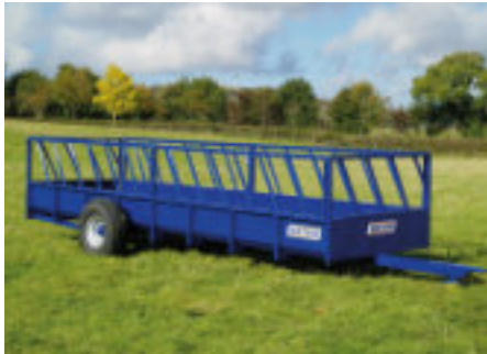
WATSON FEED TRAILERS 16' & 20' - IN STOCK SOON