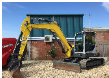
WACKER NEUSON EZ80 MIDI 2016, GOOD COND. - £39,995