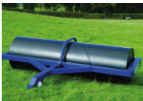
WATSON 10' BALLAST ROLLER NEW, IN STOCK, 1 ONLY - £1,525

EX-HIRE TRACTORS NOW AVAILABLE - RANGE OF HP AND LOW HOURS, FULLY SERVICED. TALK TO YOUR C&O SALES PERSON TO FIND OUT MORE DETAILS AND PRICES.