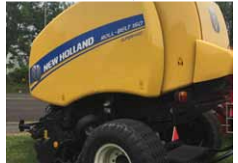
New Holland RB 150 baler New Superfeed baler, 2.3m wide pick up, Drop floor, Dual Density, 2016 build £22,500