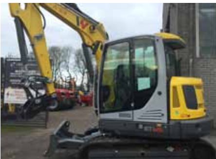
Wacker Neuson ET65 Midi Excavator NEW – with 4 buckets & Harford quick hitch £43,995