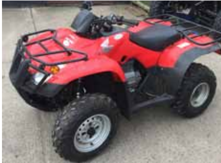
Honda TRX250 £2,250