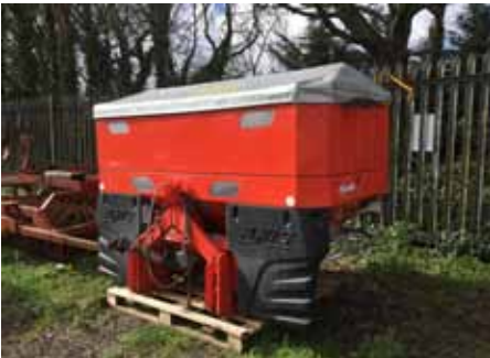
Kuhn 40.1 fertiliser spreader Complete with electronic application rate adjustment and weighing system £3750