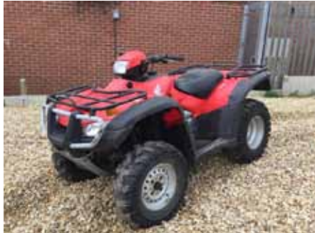
Honda 500 FA New tyres, Tidy machine, full road legal £3,750