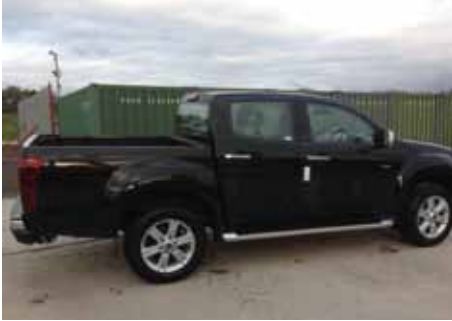
Isuzu Yukon 1.9 Automatic. On the road price, inc. VAT, Reg & Road Tax £28,025