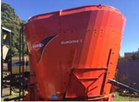
Kuhn 1270 Verticle tub feeder Clean & tidy £8,950