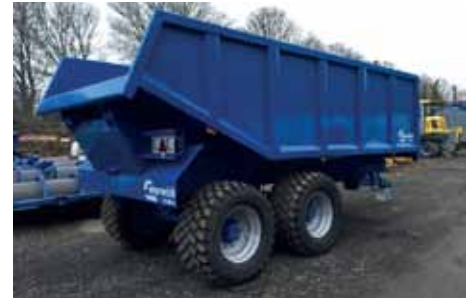
Warwick 14 Tonne High Dump Trailer NEW STOCK Parking Brake, 550 x 45R, x 22.5 Floatation tyres, LED Lights, Two Year Warranty £13,950