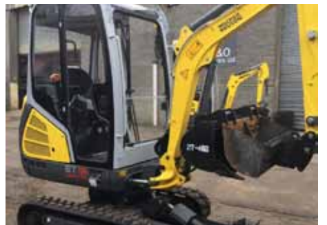
Wacker Neuson ET18 Excavator NEW with 4 buckets and Martin Quick Hitch £18,975