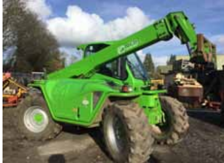
Merlo 42.7 CS Boom suspension, Pick up hitch £32,500