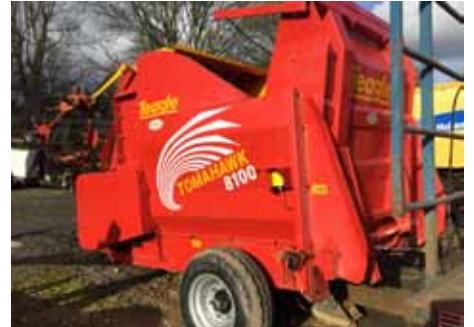
Teagle Tomahawk 8100 Straw Shredder Bluetooth controls £6,950