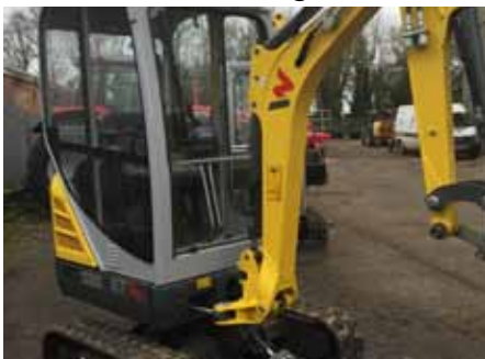
Wacker Neuson ET16 Excavator NEW with 4 buckets and Martin Quick Hitch £15,995