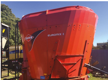
Kuhn 1270 Verticle tub feeder Clean & tidy £8,950