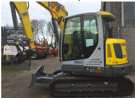
Wacker Neuson ET65 Midi Excavator NEW – with 4 buckets & Harford quick hitch £43,995