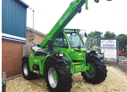
Merlo 42.7 telehandler 156hp, Boom suspension, Air seat, 470 hours, '66 plate, 24" Michelin, Pick up hitch, Merlo headstock, In as new condition, 18 month warranty. £52,950