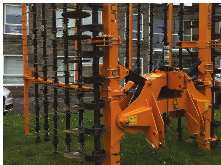
Mzuri Rake Ex-Demo SPECIAL PRICE £14,950