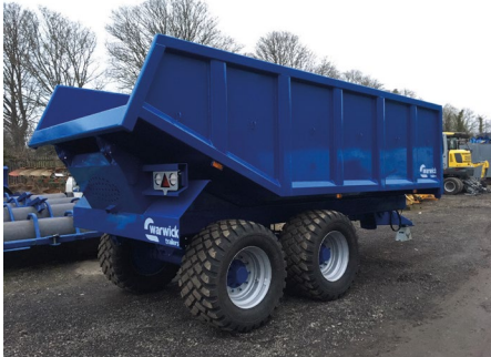
Warwick 14 Tonne High Dump Trailer NEW STOCK Parking Brake, 550 x 45R x 22.5 Floatation tyres, LED Lights, Two Year Warranty £13,950