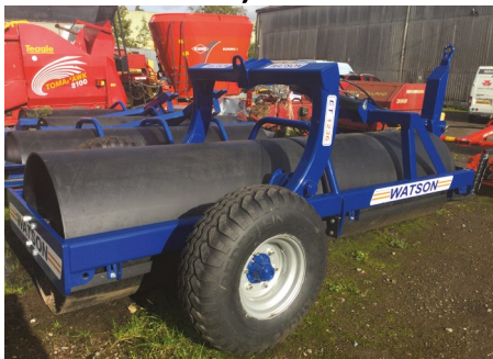
Watson ET 1236 end tow roller, 12 ft long, 36" diameter ballast roller £4,450