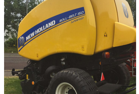
New Holland RB 150 baler New Superfeed baler, 2.3m wide pick up, Drop floor, Dual Density, 2016 build £22,500