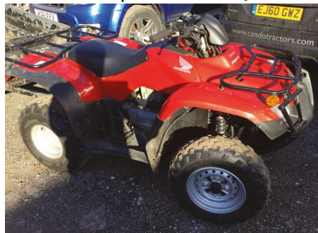
Honda 250 Manual 2WD, '15 plate, excellent condition £2,750