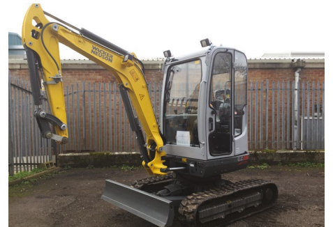
Wacker Neuson EZ28 Excavator NEW - with cab, 12", 18" and 24" buckets, ditching bucket, Martin quick hitch £25,785