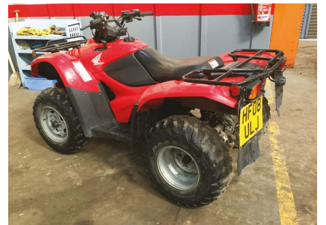
Honda 420 Manual '08 plate, road legal £3,350