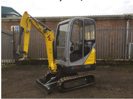
Wacker Neuson ET16 Excavator NEW – with cab, 12", 18" and 24" buckets, ditching bucket, Martin quick hitch £15,995