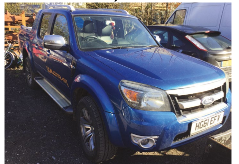
Ford Ranger Wildtrack '61, in good condition £8,750