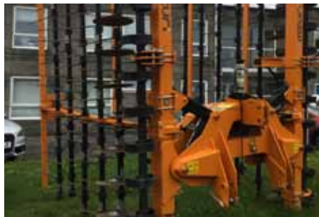
Mzuri Rake Ex-Demo SPECIAL PRICE £14,950