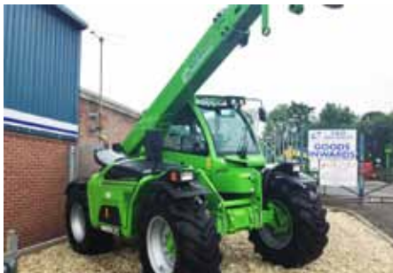
Merlo 42.7 telehandler 156hp, Boom suspension, Air seat, 470 hours, '66 plate, 24" Michelin, Pick up hitch, Merlo headstock, In as new condition, 18 month warranty. £52,950