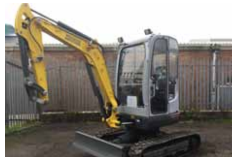
Wacker Neuson EZ28 Excavator NEW – with cab, 12", 18" and 24" buckets, ditching bucket, Martin quick hitch £25,785