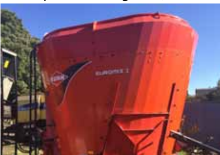
Kuhn 1270 Verticle tub feeder Clean & tidy £8,950