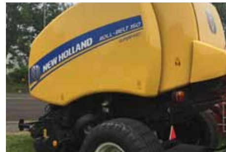
New Holland RB 150 baler New Superfeed baler, 2.3m wide pick up, Drop floor, Dual Density, 2016 build £22,500