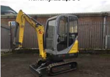
Wacker Neuson ET16 Excavator NEW – with cab, 12", 18" and 24" buckets, ditching bucket, Martin quick hitch £15,995