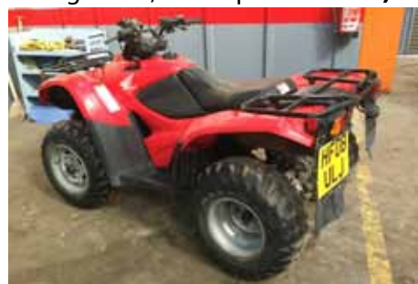
Honda 420 Manual '08 plate, road legal £3,350