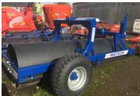
Watson ET 1236 end tow roller, 12 ft long, 36" diameter ballast roller £4,450