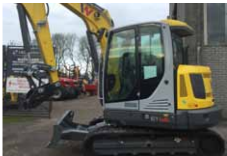
Wacker Neuson ET65 Midi Excavator NEW – with 4 buckets & Harford quick hitch £43,995