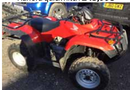
Honda 250 Manual 2WD, '15 plate, excellent condition £2,750