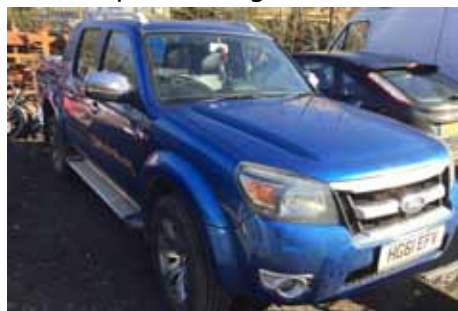
Ford Ranger Wildtrack '61, in good condition £8,750