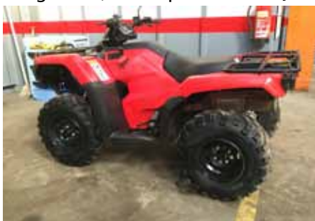
Honda 420 Manual '16 plate, road legal £4,250