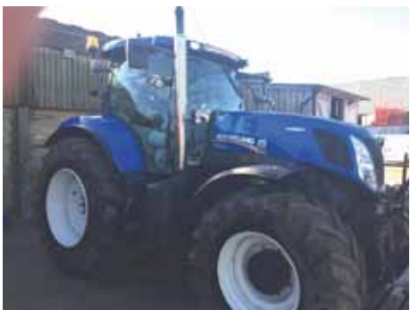
New Holland T7.260 Auto Command, Gold Cover, Front linkage Good tyres, PLM ready Special Terms Apply