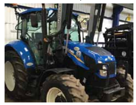
New Holland T5.105 '13 plate, 24x24 Dual Command, Quicke 46 loader, Boom susp. £31,500