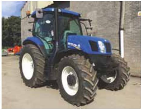
New Holland T6.160 4WD, Electro Command, 50KPH, high spec and 250 hours £49,950