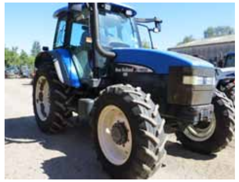
New Holland TM120 4WD, '54 plate, Range Command Good tyres, Tidy for age. £18,500