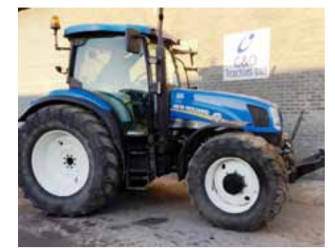
New Holland T6050 Elite '11 plate, Front linkage & PTO, Cab & front suspension £23,950