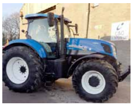
New Holland T7.235 Auto Command, '13 plate, Front linkage & PTO, Cab & front susp. £46,000