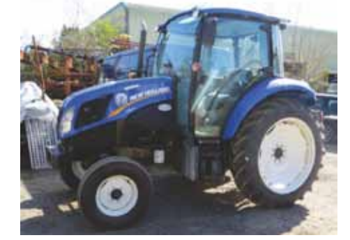
New Holland T4.75 '13 plate, L/H shuttle, Refurbished £16,500