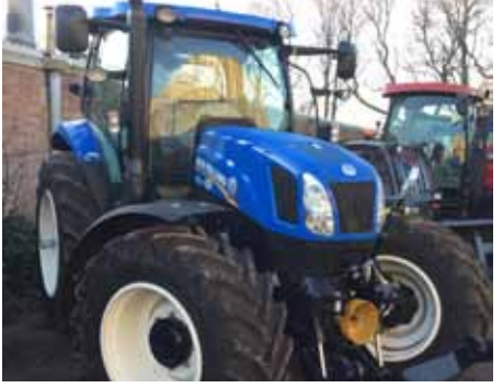
New Holland T6.165 Dual Command, Front linkage & PTO, Cab & front suspension, 90 hours Service Plus £49,950