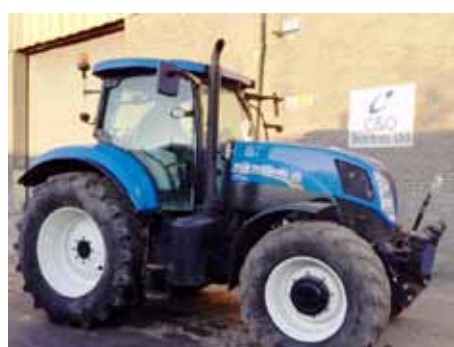
New Holland T7.200 '13 plate, Front linkage, Cab & front suspension. £34,950