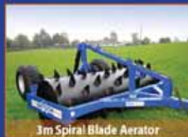
3m Spiral Blade Aerator