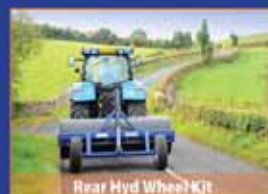
Rear Hyd Wheel Kit