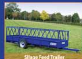
Silage Feed Trailer