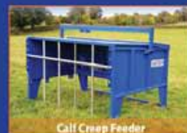
Calf Creep Feeder