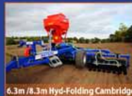
6.3m / 8.3m Hyd-Folding Cambridge