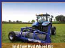
End Tow Hyd Wheel Kit