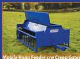
Mobile Hogg Feeder c/w Creep Gates