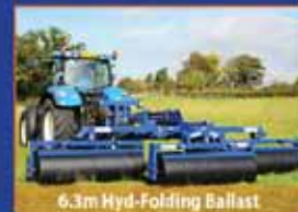
6.3m Hyd-Folding Ballast