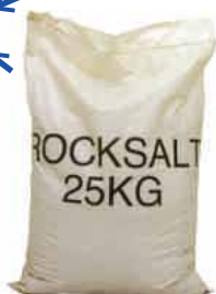
Rock Salt 25 kg bag £6.20