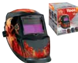
042254 Zeus red welding helmet £91.00