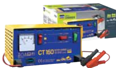
024106 Gys CT 160 Battery charger £49.60