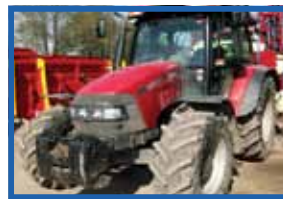
Case JXU105 , '09, Very Tidy, LP Tyres, 1600 hrs Purchase Price £26,500, 10047316 (B)