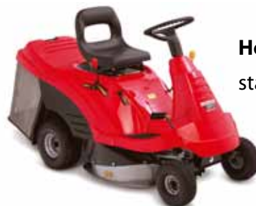
Honda Ride-On's starting at £1700