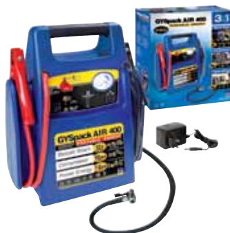
026322 Gyspack Air 400 Booster £141.00