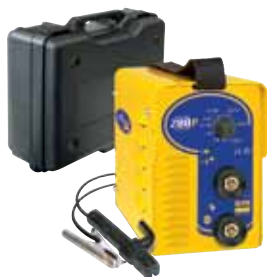
030794 Welding Unit £311.00

Welding Wire & Electrodes In Stock At Competitive Prices