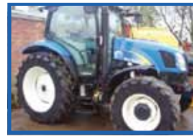
NH T6020 , Delta, '09, 2100 Hours, Dual Command, 420/85/38, Tidy Purchase Price £25,500, 10044965 (B)