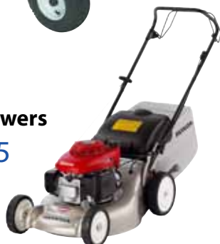
Honda Izy Mowers from £275