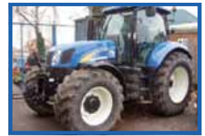
NH T6080 , '09, Range Command, Terraglide, Front Linkage, Tidy Purchase Price £34,950, 20047242 (W)