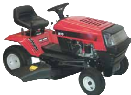
Cub-Cadet Ride-On's from £2800

C&O Tractors Wilton Depot, which specialises in Garden Machinery and Groundcare, have just launched their end of season sale.