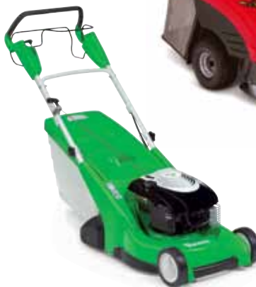
Viking Lawnmowers starting at £200