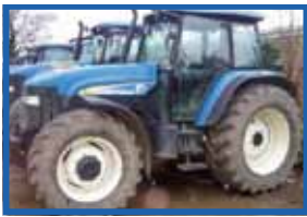
NH TM140 , '06, 7150 Hours, Dual Command, Front Linkage, PTO, 4 Spools, 600/65/38, Tidy Purchase Price £23,250, 10044963 (B)