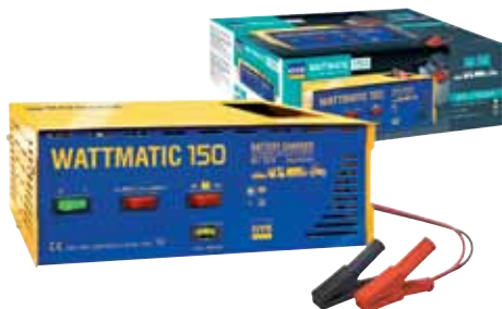
024847 Wattmatic 150 Battery Charger £94.00